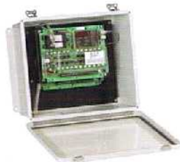
44 Channel Package