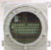
DCT in optional Explosion-proof Enclosure

for the Series DCT1000, Series DCT500A and DCT600