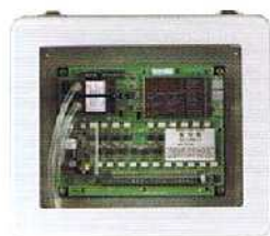
DCT1000 - NEMA 4/4X Weatherproof Enclosure

Series 1010 , Process Indicator with Alarm