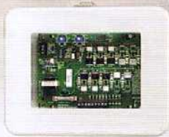
DCT500A - NEMA 4/4X Weatherproof Enclosure